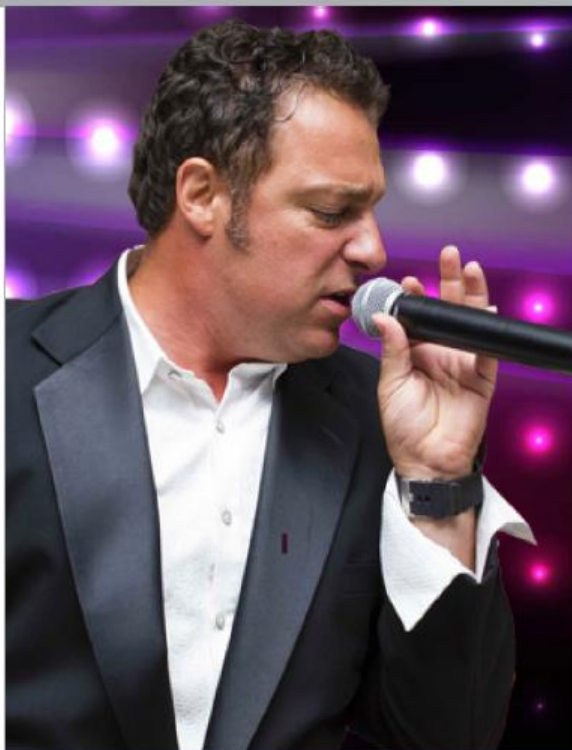
Legacy - Bringing Vegas to You!